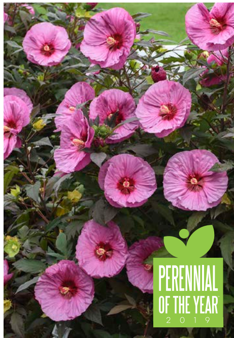
SUMMERIFIC® 'Berry Awesome' Hibiscus

H: 12" / W: 24" / Z: 3-9 / E: Part - Full Shade