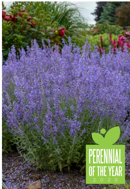
'Denim 'n Lace' Perovskia atriplicifolia

H: 12-24" / W: 10-14" / Z: 5-9 / E: Full Sun