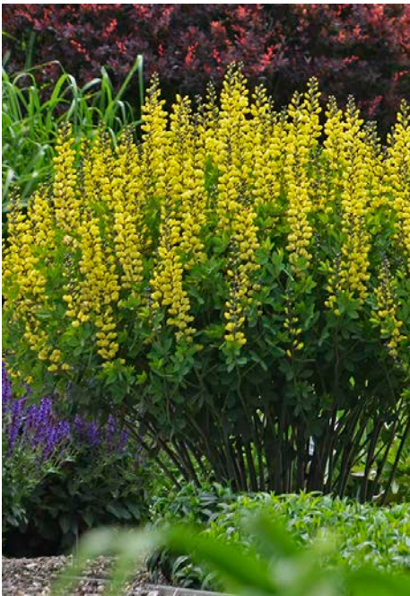
DECADENCE® 'Lemon Meringue' Baptisia

Very compact and carefree, longer flower spikes sit on top of the plant rather than within the plant.