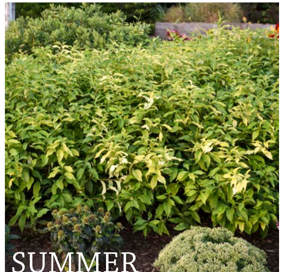
'Storm Cloud' Amsonia tabernaemontana