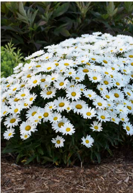
AMAZING DAISIES® Daisy May® Leucanthemum superbum

H: 17-20" / W: 24-36" / Z: 3-8 / E: Full Sun