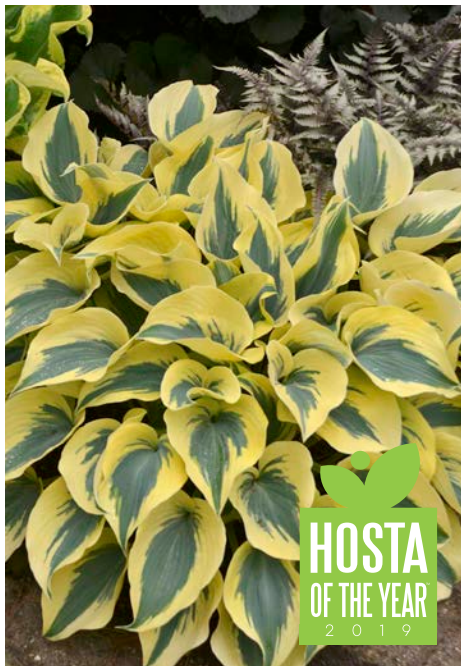
SHADOWLAND® 'Autumn Frost' Hosta

Exceedingly showy, unique color scheme, consistent performance.