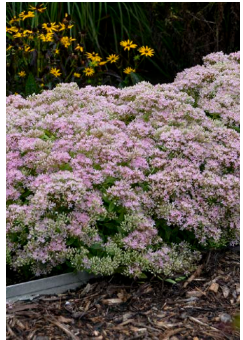
ROCK 'N GROW® 'Pure Joy' Sedum

H: 6-8" / W: 12-14" / Z: 4-9 / E: Full - Part Sun