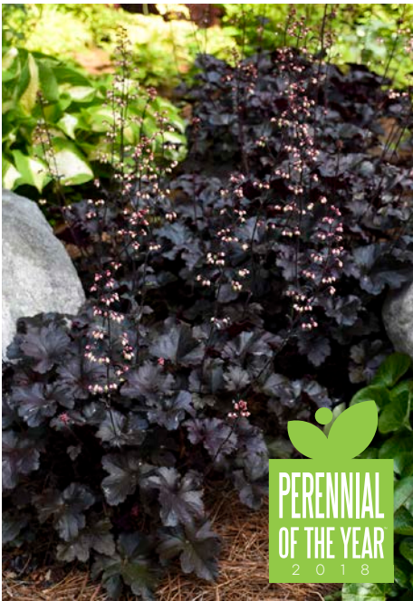
PRIMO® 'Black Pearl' Heuchera

Extremely vigorous and rugged - even in full sun! Very intense black color.