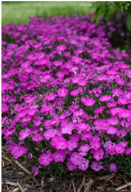
'Paint the Town Fuchsia' Dianthus

H: 3' / W: 3' / Z: 4-9 / E: Full - Part Sun