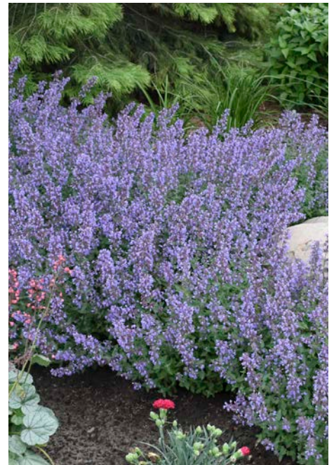
'Cat's Meow' Nepeta faassenii

Tidy, dense habit that keeps its shape all season long.