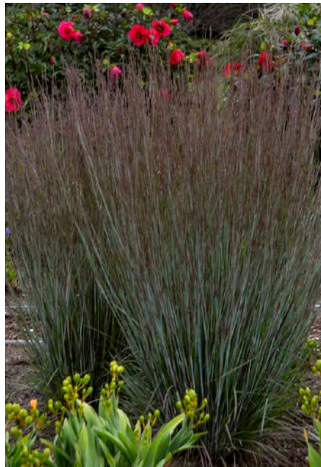
PRAIRIE WINDS® 'Blue Paradise' Schizachyrium scoparium

Elegant vase-shaped habit holds its upright form even through the snow and wind of winter.