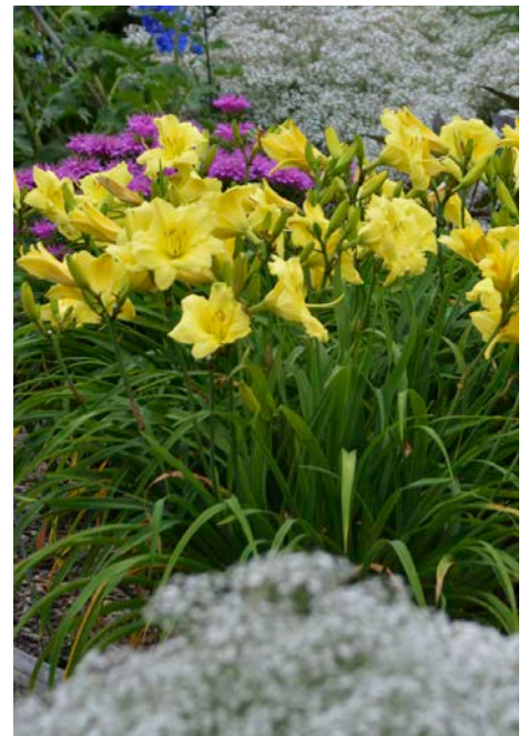
RAINBOW RHYTHM® 'Going Bananas' Hemerocallis

H: 28-32" / W: 34-38" / Z: 4-9 / E: Full Sun