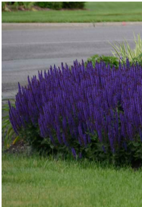
COLOR SPIRES® 'Violet Riot' Salvia

H: 24-32" / W: 20-24" / Z: 4-9 / E: Full Sun