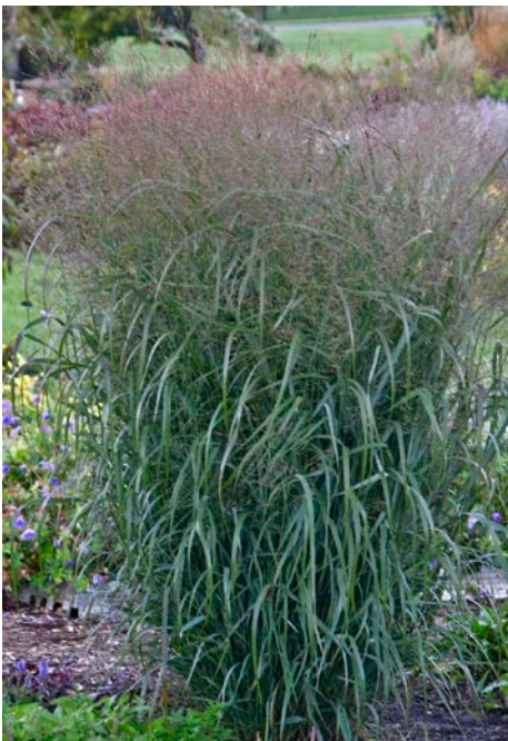
PRAIRIE WINDS® 'Apache Rose' Panicum virgatum

To ensure only the top performing perennials are put into the Proven Winners brand, each variety is trialed extensively. Like all Proven Winners perennials, the Paint the Town Dianthus series was tested alongside market standards at a range of testing sites in a variety of zones. These perennials are not only trialed in containers, but in ground as well to ensure winter hardiness and performance for many seasons.